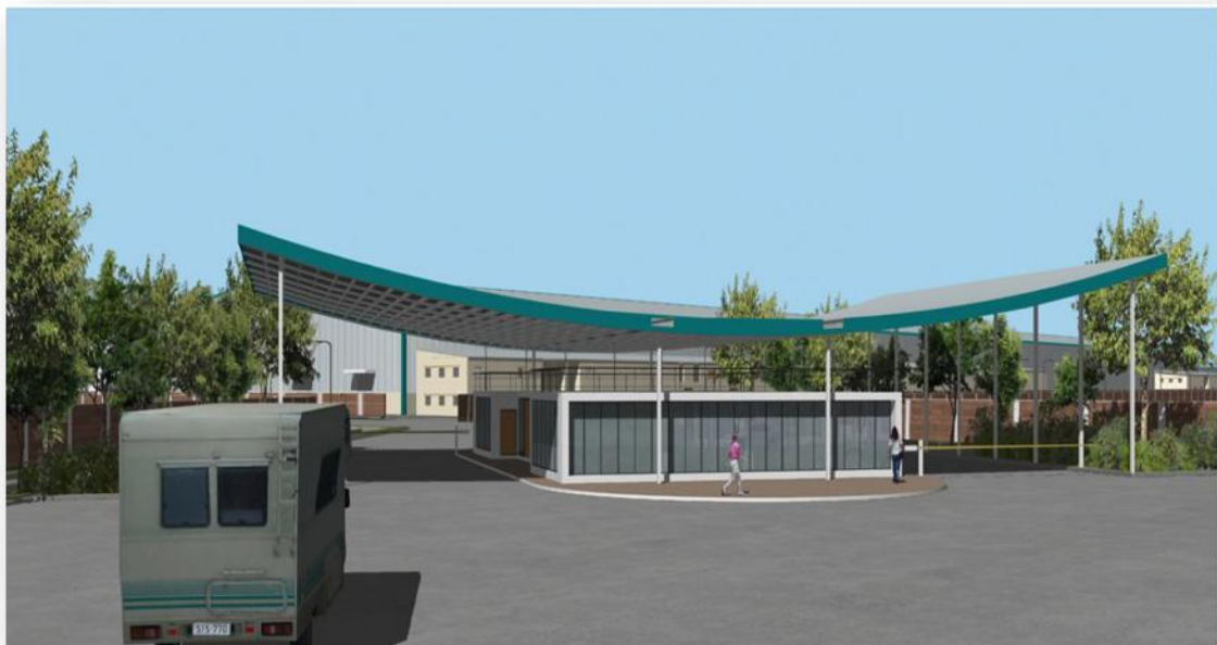
A front view of the Favorich Mega food park at Bannenhalli village, KR Pet Taluk