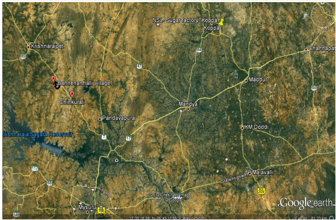
Google map showing location of Favorich Mega Food Park in Mandya District