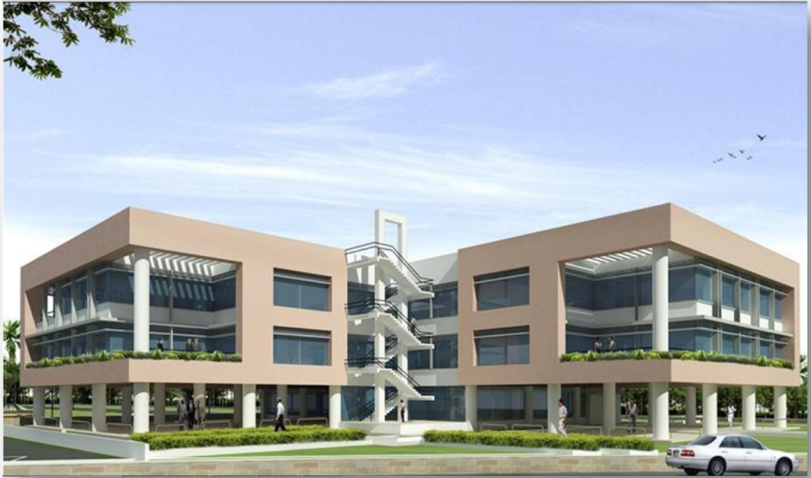
A view of Administrative and Commercial block of the Favorich Mega Food Park