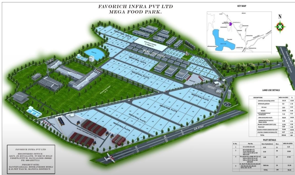
MASTER PLAN LAYOUT- MEGA FOOD PARK –CPC & IA

The food park can be broadly classified into common facilities and industrial area and is provided as below.