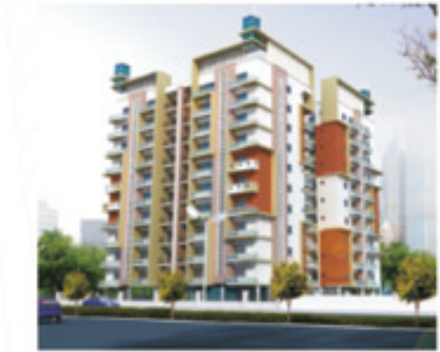
ARG MURLI HEIGHTS, Naibji Ka Bagh, Motidoongri Road, Tilak Nagar, Jaipur