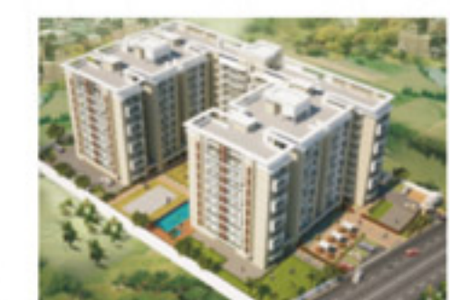
ARG ROYAL ENSIGN Nirwana Garden, Alwar