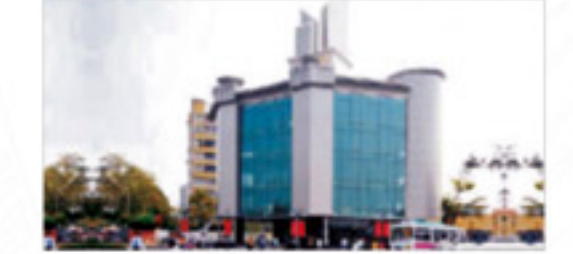
THE METRO Rambagh Circle, Jaipur