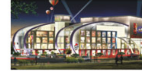
CITY MALL Jhalawar Road, Kota