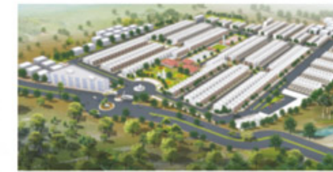
ARG PURAM Agra Road, Jaipur