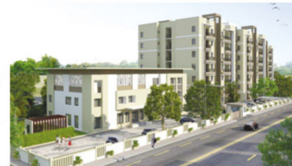
ARG VINTAGE HOMES (Retirement Homes for Senior Citizens) ARG Puram, Naila Road, Kanota, Agra Road, Jaipur