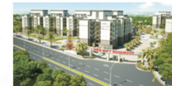
ARG CITY Jaipur Road, Ajmer