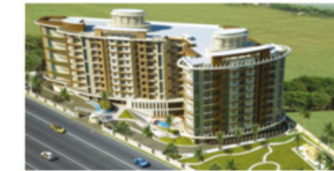
DIVINE ENCLAVE Ajmer Road, Jaipur