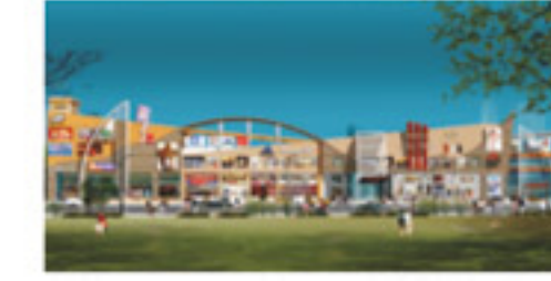
DD CITY MALL MLB Road, Gwalior