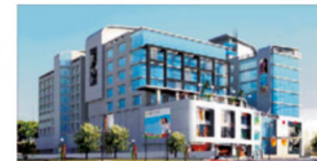
NORTH AVENUE Sikar Road, Jaipur