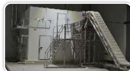
IQF (Individual Quick Freezing)