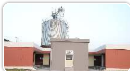
Farmer Extension Center