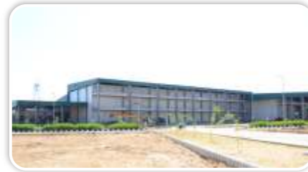
Cold Chain & IQF Facility