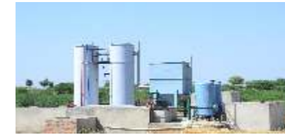
Farmer Extension Center