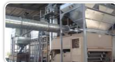
Sorting & Grading Line