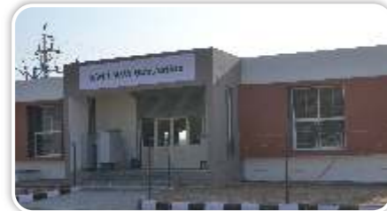
33/11 KVA Substation