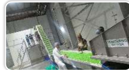
Pea Process Line