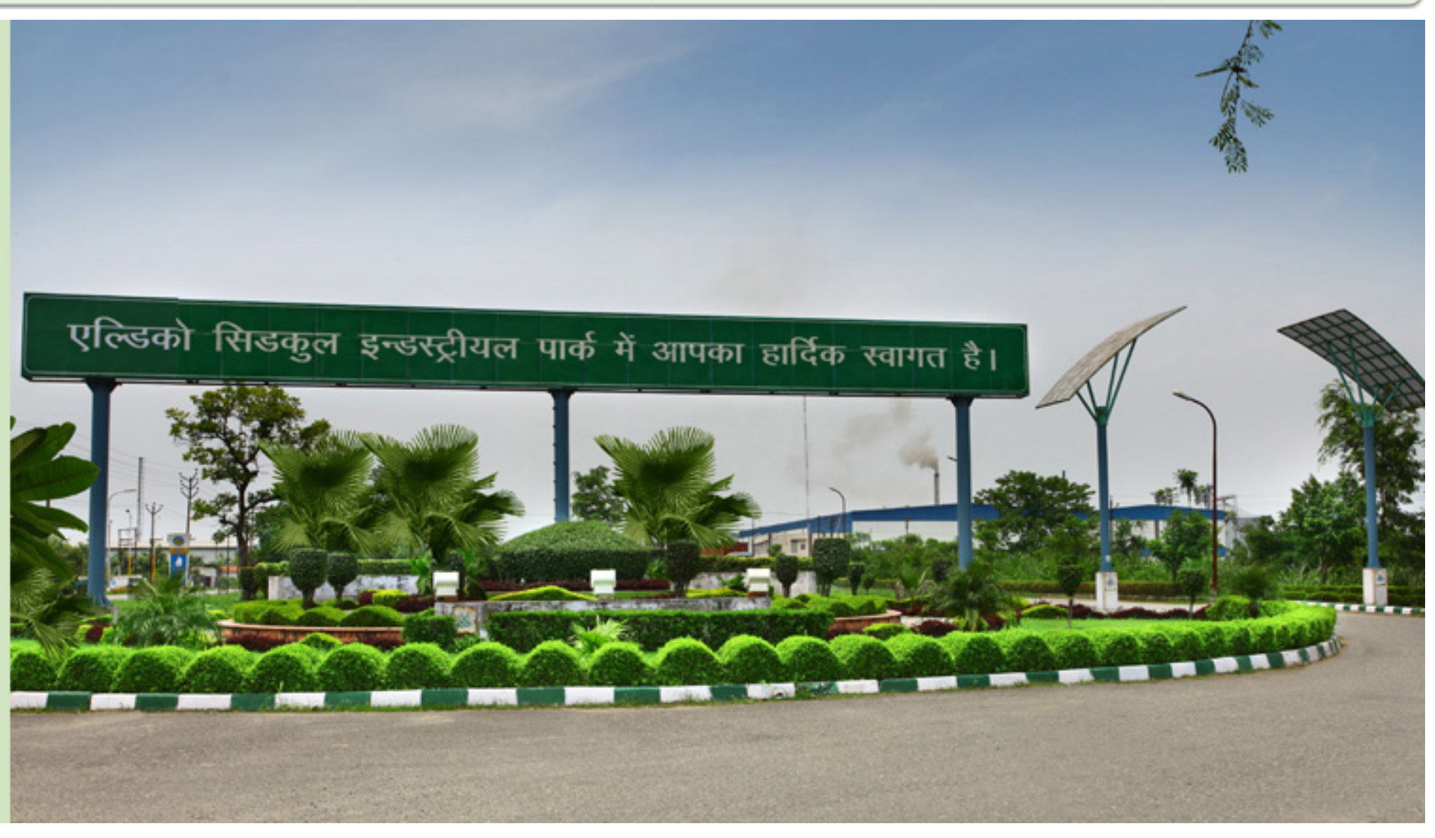
Home > Projects > Industrial > Uttarakhand > Sitarganj > Eldeco Sidcul Industrial Park > Overview