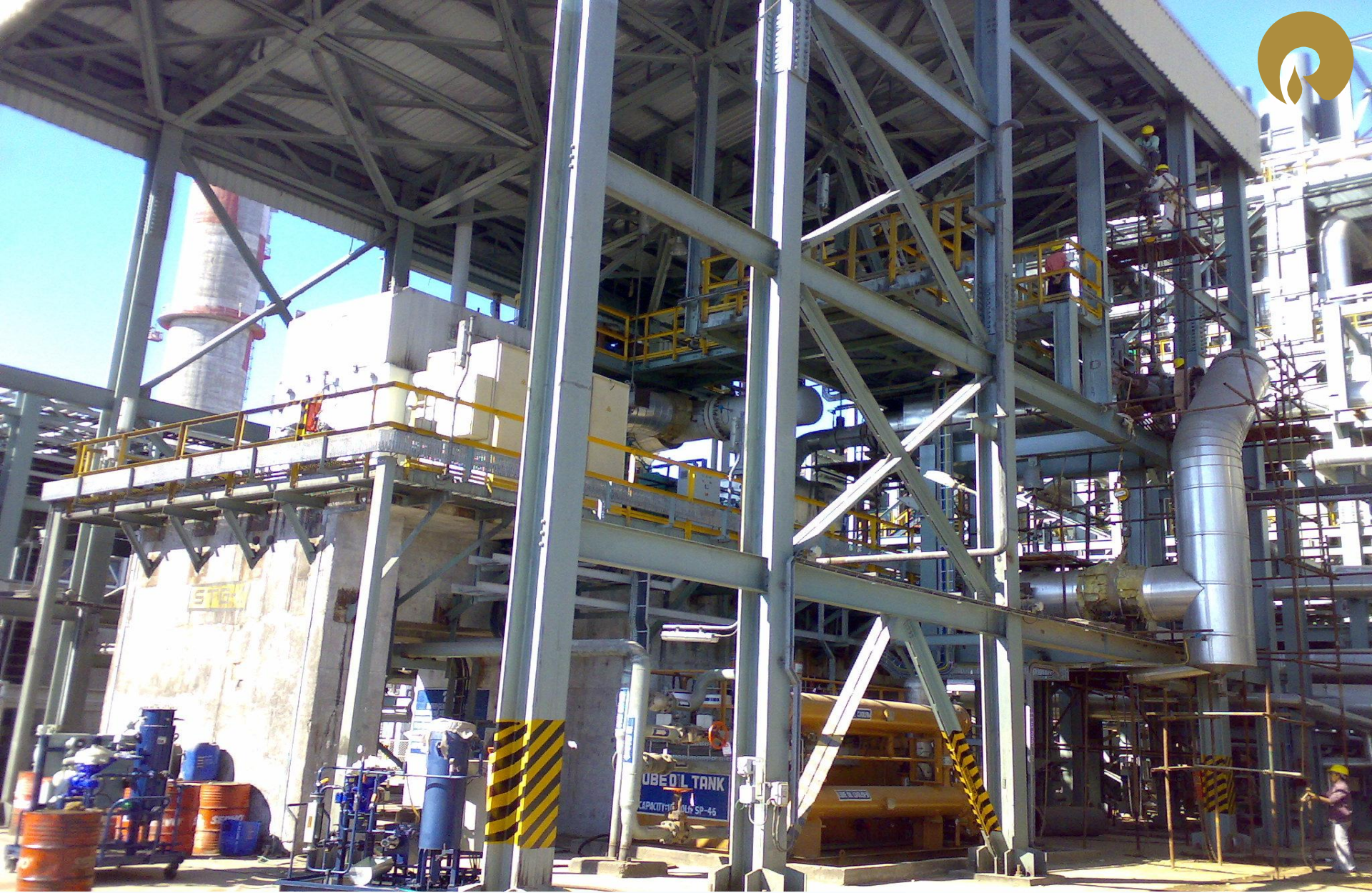
Steam Turbine Generator