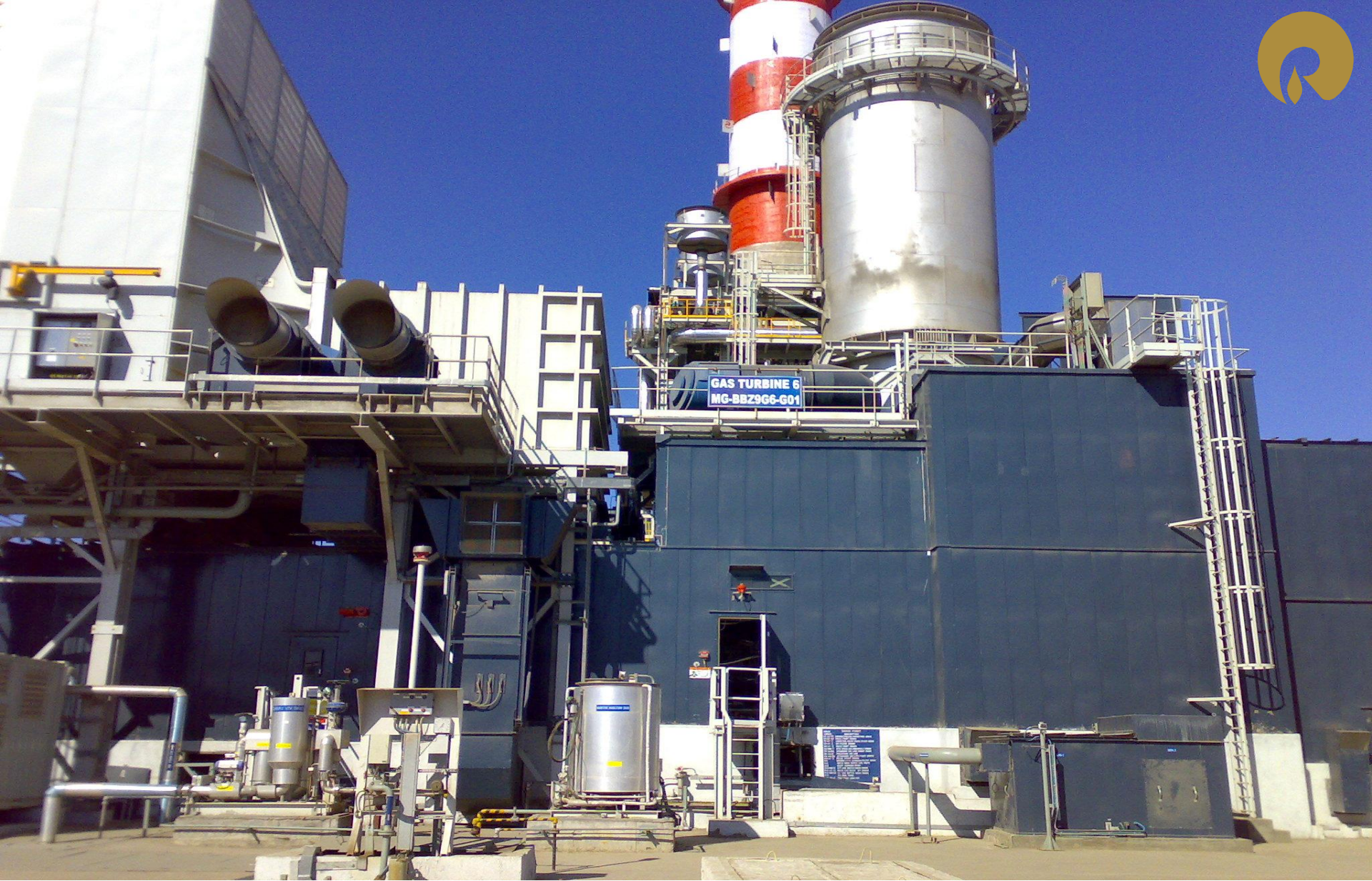
A view of the Gas Turbine