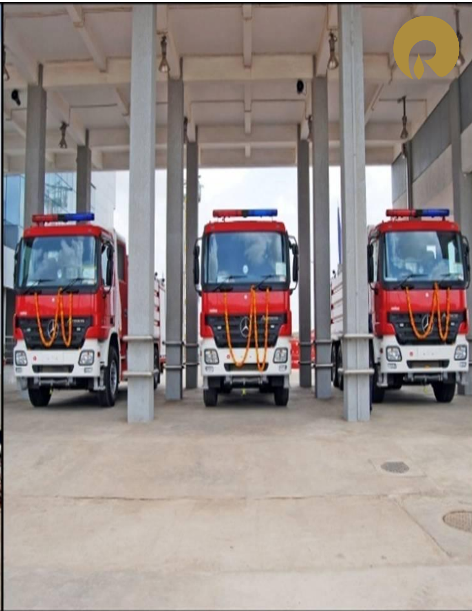
Central Fire Station & Fire Trucks