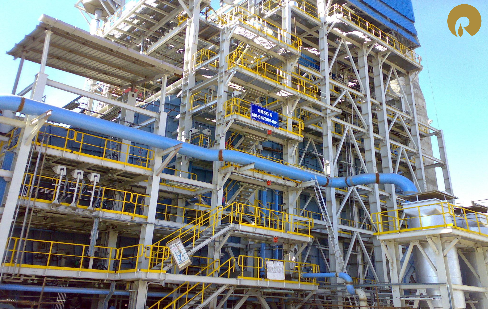
Heat Recovery Steam Generator