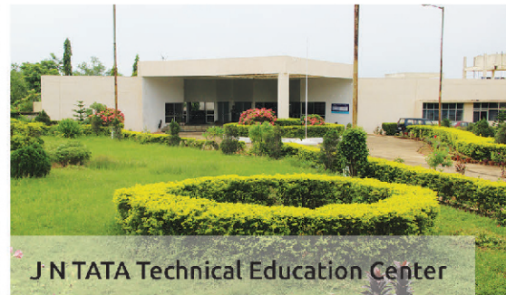
J N TATA Technical Education Center