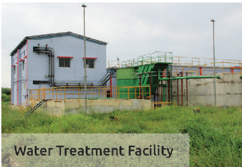
Water Treatment Facility