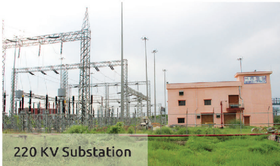
220 KV Substation