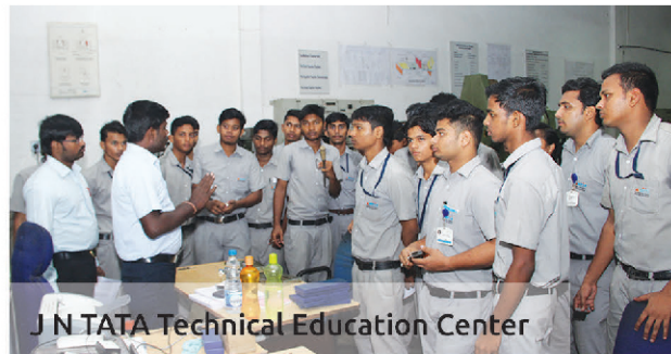
J N TATA Technical Education Center