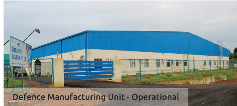
Defence Manufacturing Unit - Operational