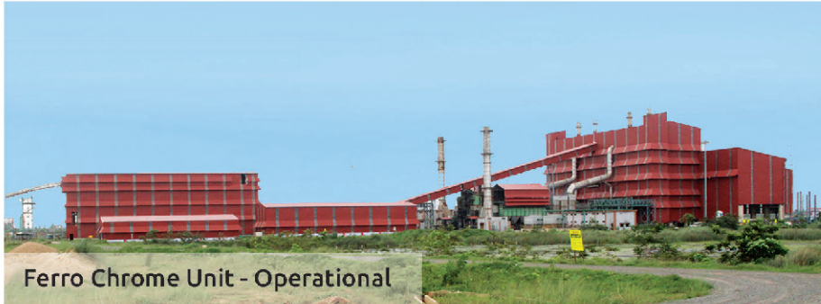
Ferro Chrome Unit - Operational